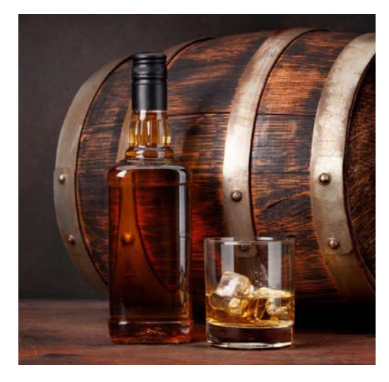
Whiskey barrel manufacturers require high-force pressing machines to install metal hoops during barrel assembly.

In one recent application example of the move to electromechanical actuation, a whiskey barrel manufacturer replaced its hydraulic pressing equipment with all-electric machines.